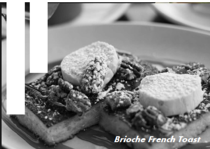
Brioche French Toast